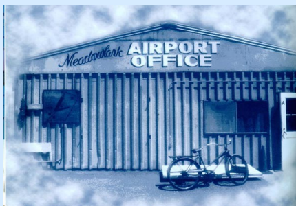
Association of California Airports To Educate, Advocate and Assist

5. HONORARY membership shall be conferred by action of the membership of ACA at large, to those individuals specifically recognized for their outstanding dedication and achievement in the field of airport development, management, operations or any related field of aviation. The Board of Directors must approve nominations prior to action by the membership.